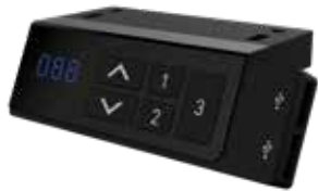
3 Memory Controller with 2 USB Ports