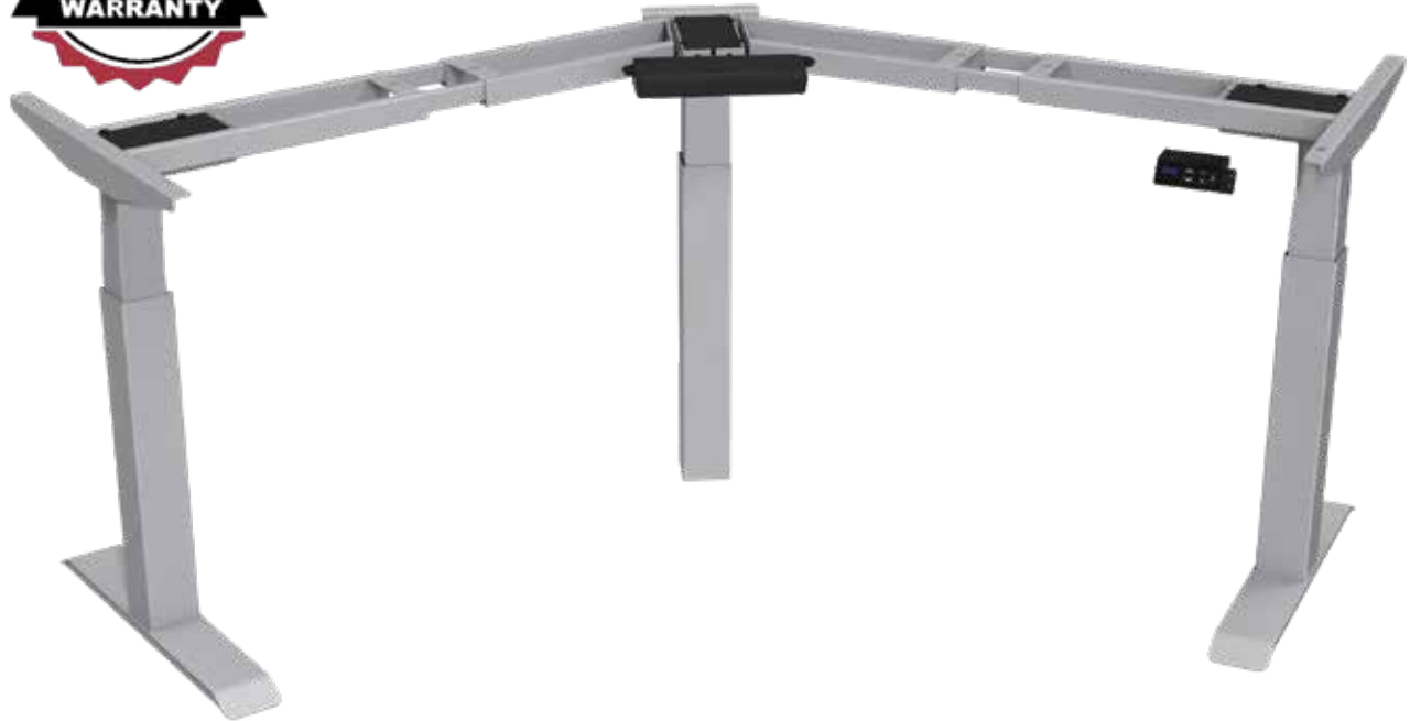
(-BS) Brushed Silver