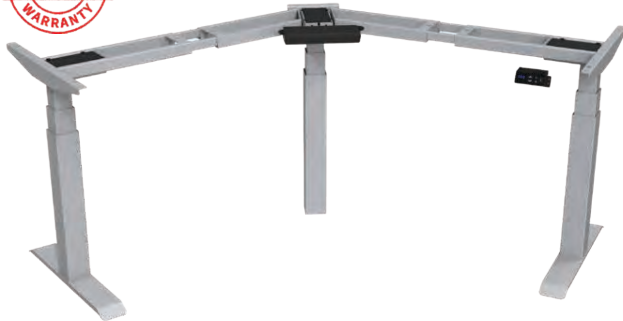
(-BS) Brushed Silver