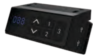
3 Memory Controller with 2 USB Ports