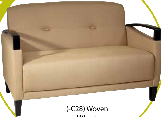
(-C28) Woven Wheat