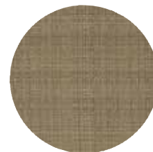
(-S22) Woven Seaweed