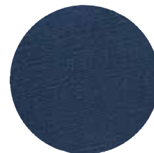
(-W17) Woven Indigo